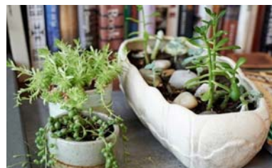
WORKSHOPS WITH A HEART