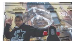
THE GOOD DEED - THE STORY OF A YOUNG BOY November 17, 2014 In "Arts + Lifestyle"

RELATED ITEMS COLLINGWOOD FRENCH JO RITTEY LANGUAGE THEATRE