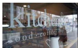
WAKE UP AND SMELL THE COFFEE | KITCHEN AND PANTRY