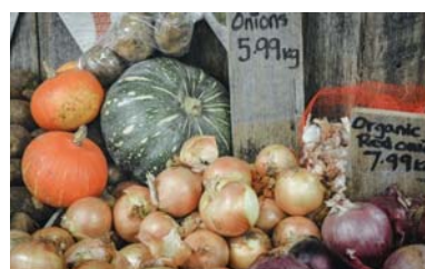
FOOD AS A MOVEMENT