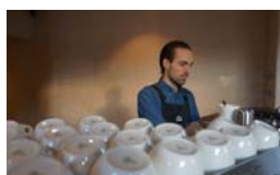
WAKE UP AND SMELL THE COFFEE | CROMPTON COFFEE