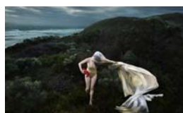
LILLI WATERS: ANJA