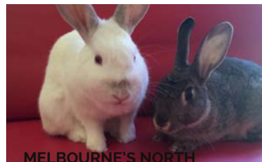
MELBOURNE'S NORTH POISED FOR RABBIT CAFE