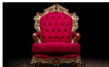
THEATRE IN COLLINGWOOD