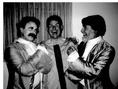
Dorante, Frontin and Le Comte