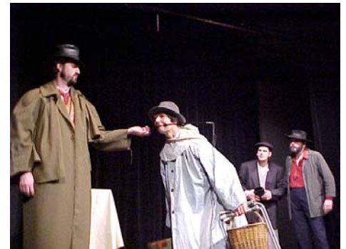
A scene from Godot - Pozzo, Lucky, Estragon and Vladimir