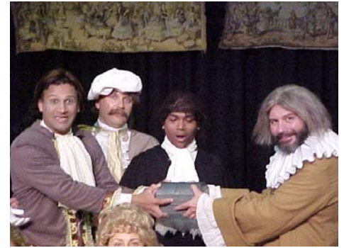
"... donnez-moi la cassette!"