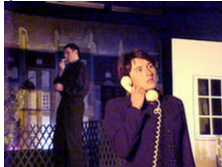
Dominique (Georges) Valérie (Charlotte)

JULY - Cuisine et Dépendance by Jaoui & Bacri