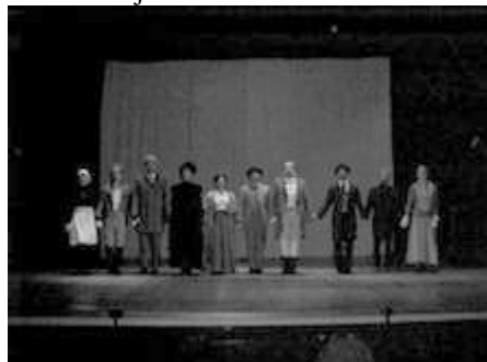
L'Equipe de Perrichon